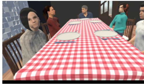
Fig. 1. Family in oculus viewer 1.

The subjects who participated in the research were subjected to, pre- and post-experiment, with a view to measure their anxiety level by means of a self-administered psychometric instrument, the STAI-X (Sanavio et al. (1997)), which detects state, trait and post-treatment anxiety. Initial anxiety in subjects was triggered and self-induced, prior to administration, by asking them to imagine stressful situations that were meaningful and emotionally relevant to them. The metaphors used in the research were independently chosen by each subject and for each of them, two were used. Both the subjects in the control group and those in the experimental group were treated with the technique of therapeutic metaphors, which incorporates Gordon's model (Gordon (1992)) and Mills and Crowley's technique (Mills (1988)), but extends it and makes it innovative thanks to the fact that a transformative dialogue is established with them, with the difference that in the group that we could define as the control group, taken from clinical practice, the interaction took place only at an imaginative