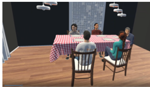
Fig. 2. Family in oculus viewer 2.

level and was simultaneously shared with the therapist, in the group subjected to the experiment, the metaphors were translated on a virtual level and used in an immersive context (see fig.1, fig.2, fig.3). This was done in order to isolate the variable "dialogue-interaction with virtual metaphor" (intervening variable) from that "dialogue-interaction with imaginative metaphor" (control variable). A second control group was treated in the following manner: the subjects were allowed to spontaneously interact with the metaphors without, however, establishing any kind of dialogue with them. This was done in order to test the importance and weight of the transformative dialogue with them.